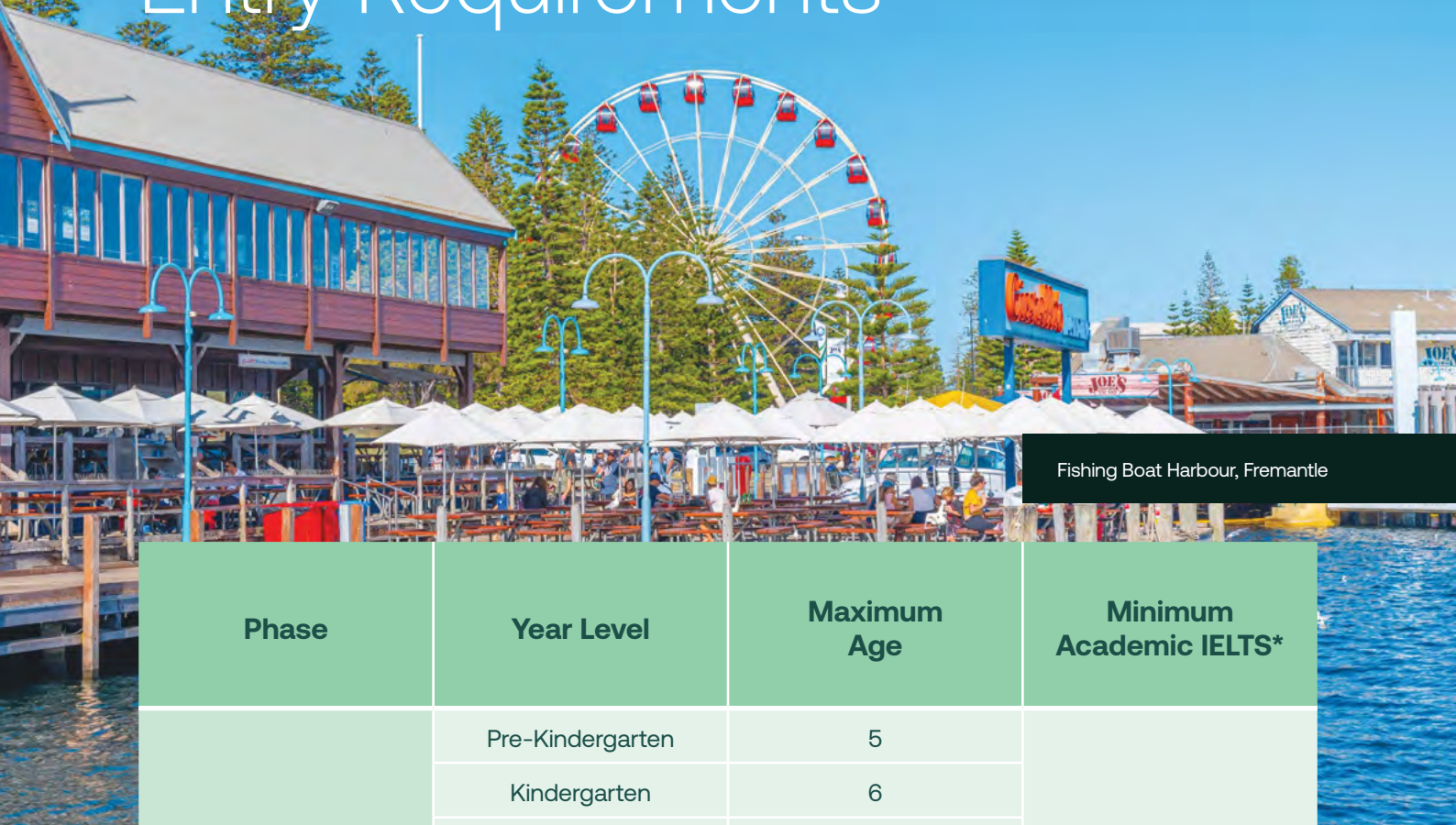
Fishing Boat Harbour, Fremantle