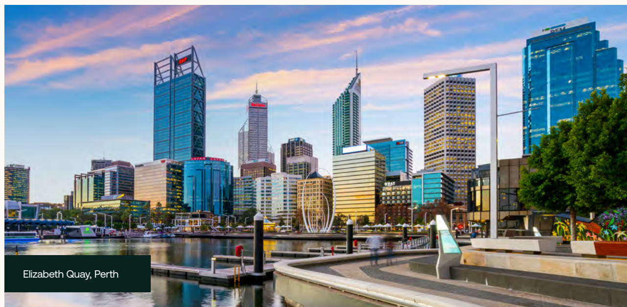
Elizabeth Quay, Perth