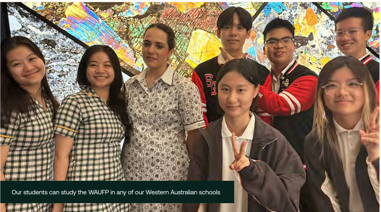
Our students can study the WAUFP in any of our Western Australian schools

A Combined Percentage Score (CPS) is calculated for all students and can be used for university entrance. The CPS is calculated by averaging the best three scaled scores (excluding ELACS) OR averaging the sum of the best three scaled scores and ELACS score, whichever is the higher, plus any bonuses.