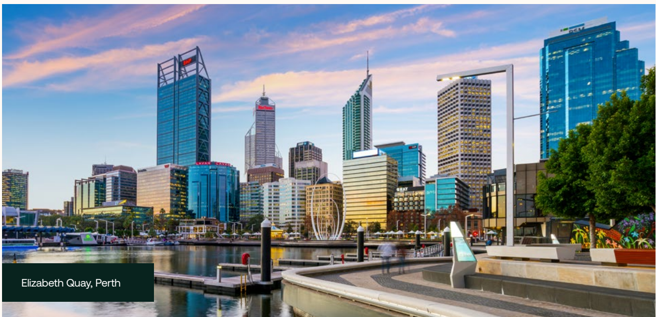
Elizabeth Quay, Perth