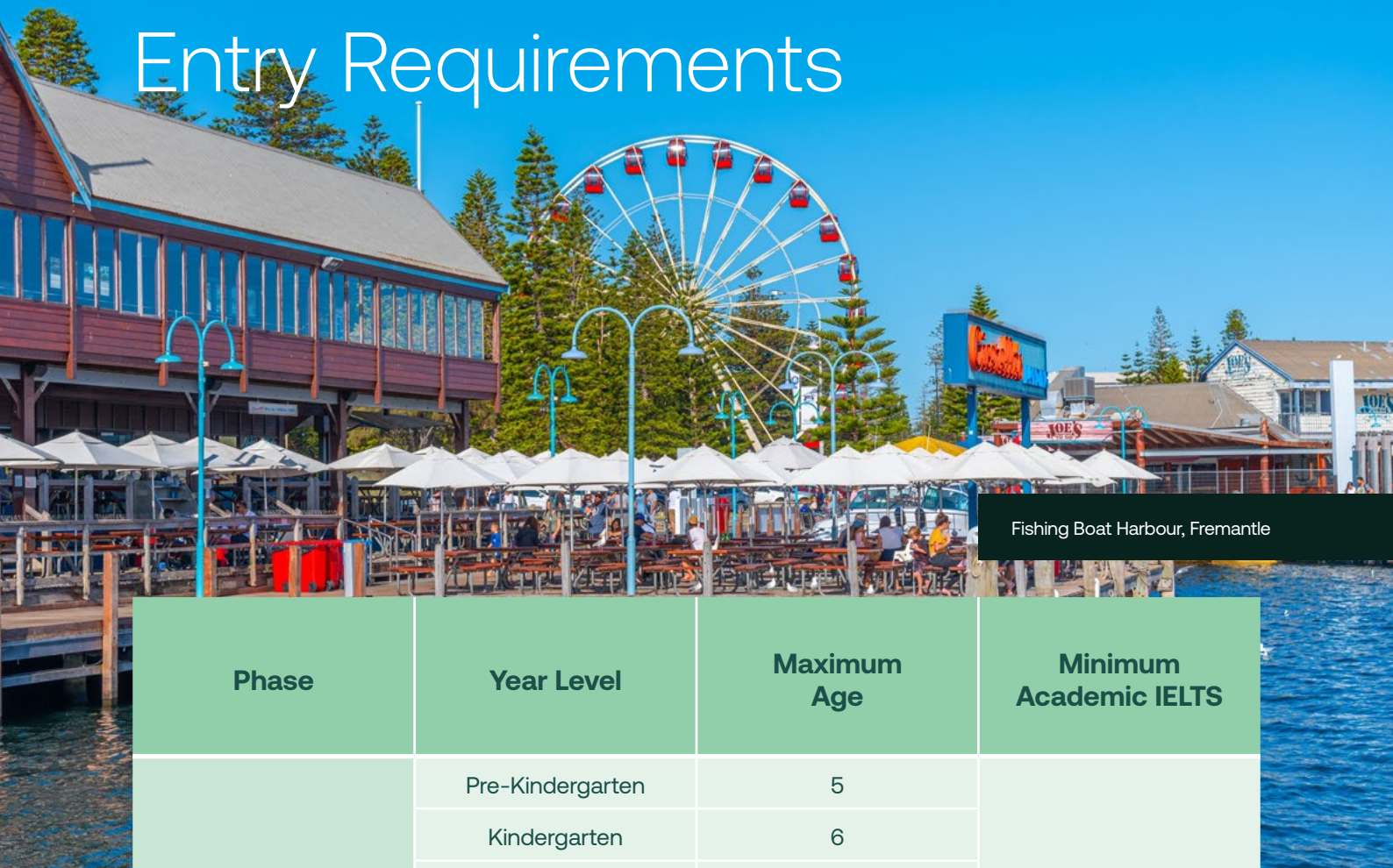
Fishing Boat Harbour, Fremantle