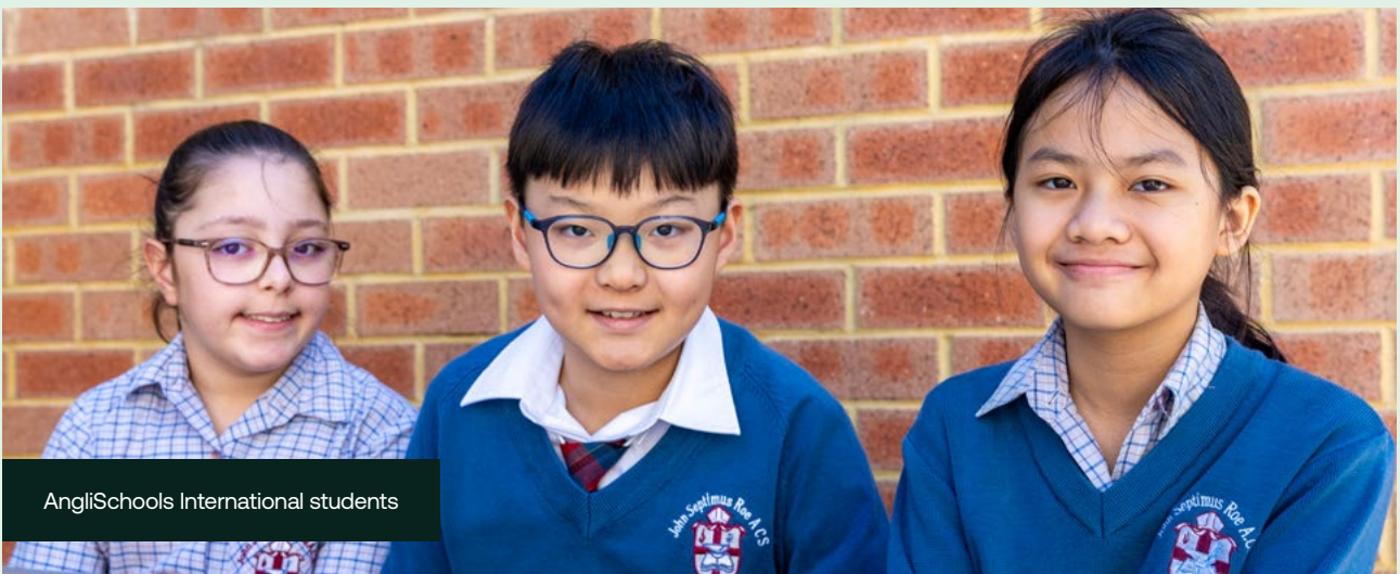
AngliSchools International students

1 x application form for multiple schools