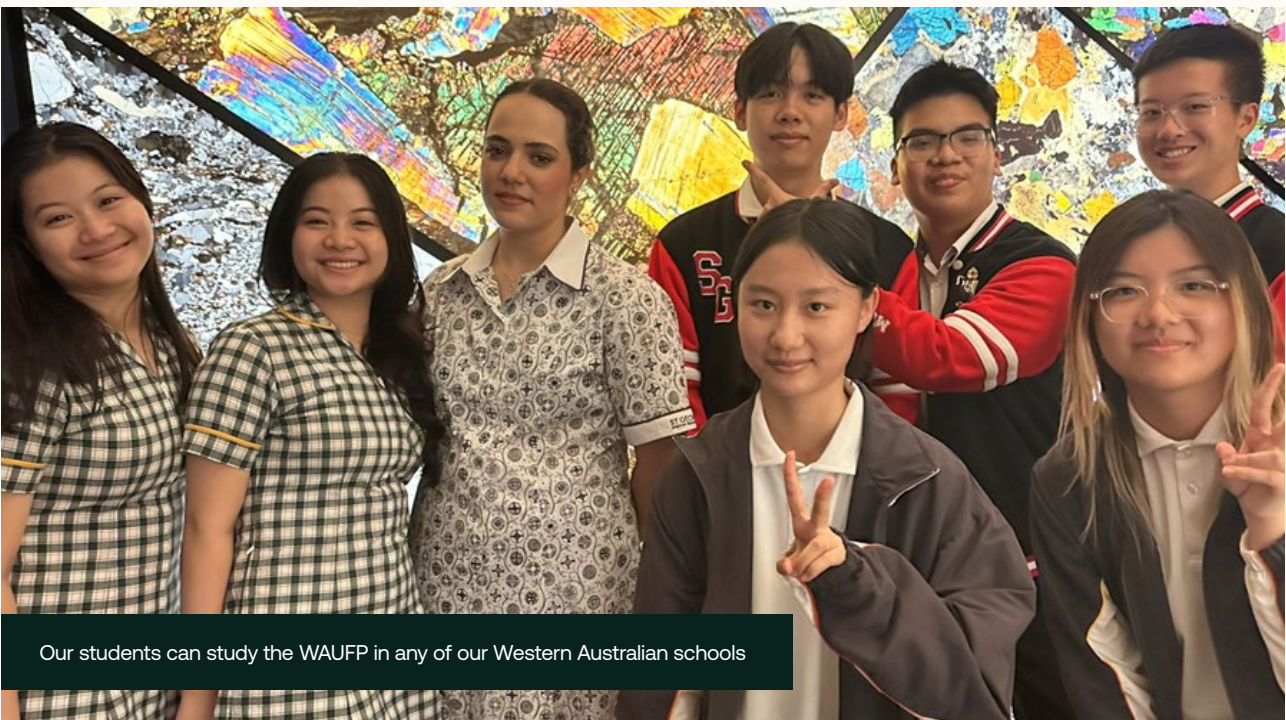
Our students can study the WAUFP in any of our Western Australian schools

A Combined Percentage Score (CPS) is calculated for all students and can be used for university entrance. The CPS is calculated by averaging the best three scaled scores (excluding ELACS) OR averaging the sum of the best three scaled scores and ELACS score, whichever is highest, plus any bonuses.